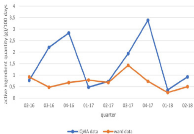
Figure 1: Longitudinal (quarterly) observation of antifungal drug use in pediatric cancer inpatients, comparing pharmacy dispensing and patient derived (ward) date in g/100,0 inpatient days.

This internal audit will provide starting points for the establishment of an AFS initiative. The establishment of a multidisciplinary protocol and training in the use of antifungal drugs can improve the quality of antifungal prescriptions and the knowledge of physicians regarding the use of particular antifungal drugs. These methods therefore play an important role in the introduction of AFS programs in pediatrics [21]. Since this analysis focuses on inpatients, it may be interesting to add data on outpatient antifungal treatment in future studies involving pediatric cancer patients.