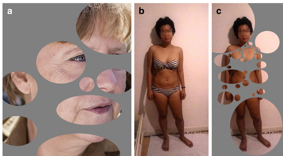
Fig. 1 a For the recognition of a known face, often only few details are sufficient (German chancellor A. Merkel, 2014). b, c Typical example of “bubbling” to imply nudity (author’s friend, pixelation for anonymity only)