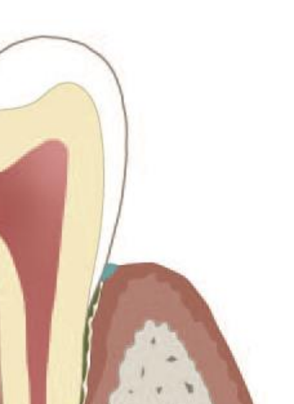
Figure 2. Occlusion of marginal pocket either by aggregated NETs (aggNETs), or by attachment of the marginal epithelium to the root. The underlying pocket epithelium continues to secrete gingival crevicular fluid, and polymorphonuclear neutrophils (PMNs) continue to transmigrate. The exact nature of the plug (depicted blue) has not been clarified yet [87,113].